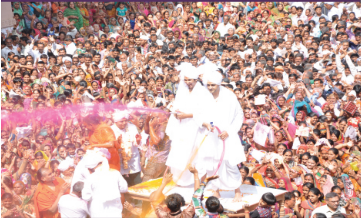
H.H. Shri Acharya Maharaj and H.H. Shri Lalji Maharaj performing Samaiyo of Vasant Panchami by playing with colours in Shree Swaminarayan temple, Muli.

Registered under RNI NO.-GUJENG/2007/20198 *Permitted to post at Ahd PSO on 11th every month under postal Regd. No.GUJ.582/12-14 issued SSP Ahd Valid up to 31-12-2014