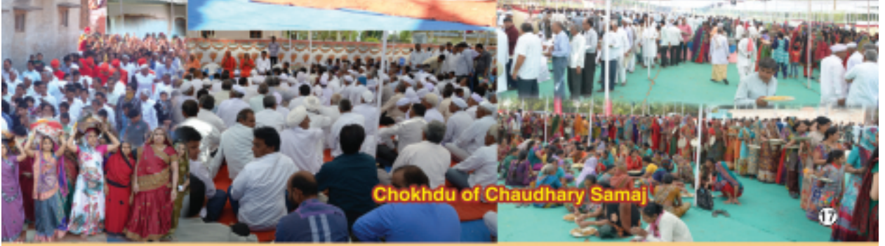
Chokhdu of Chaudhary Samaj