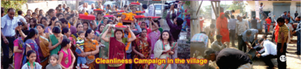
Cleanliness Campaign in the village