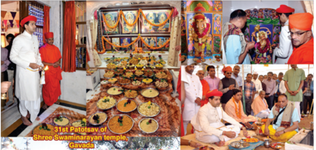
31st Patotsav of Shree Swaminarayan temple, Gavada