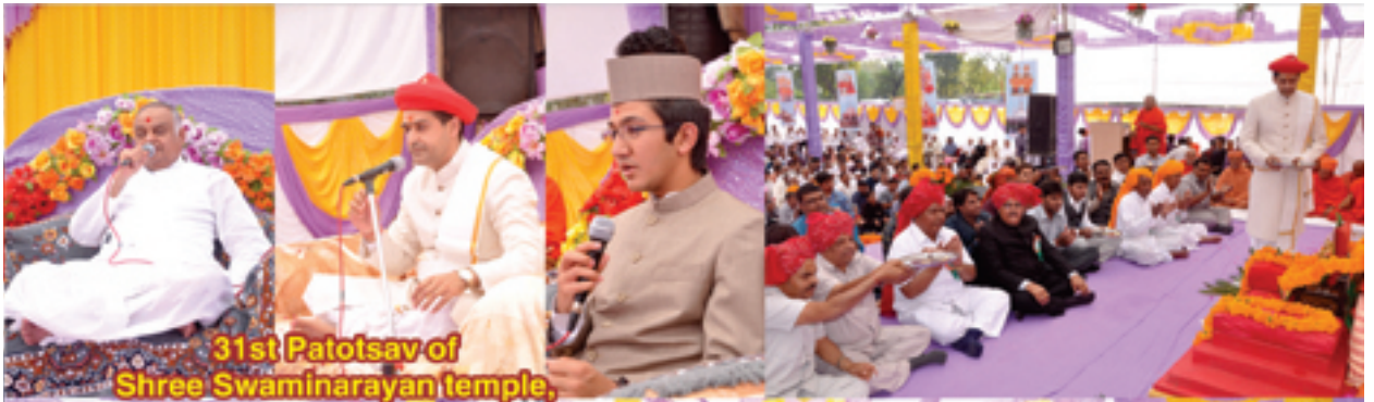
31st Patotsav of Shree Swaminarayan temple, Gavada