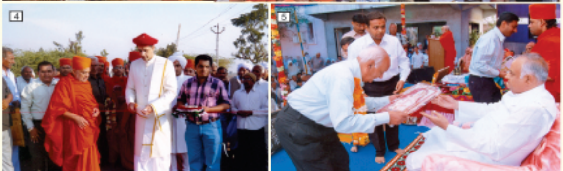
1) H.H. Shri Acharya Maharaj granting blessings in the Sabha organized on the invocation of the idol images in Shree Swaminarayan temple, Jamfalvadi, Ahmedabad. (2) H.H. Shri Acharya Maharaj granting blessings in the Sabha on the occasion of Patotsav of Shree Swaminarayan temple, Vihar and the host family performing aarti of H.H. Shri Acharya Maharaj. (3) H.H. Shri Acharya Maharaj performing Annakut aarti and granting Darshan in Shobhayatra on the occasion of invocation of the idol images of Shree Swaminarayan temple, Ghanshyamnagar-Dhanala (Muli Desh). (4) H.H. Shri Acharya Maharaj performing inauguration of artistic Entrance Gate of Jasapara village (Muli Desh) alongwith the donor Shri Rameshbhai Patel. (5) The host devotee Shri Harikrishnabhai Gandhi performing poojan of H.H. Shri Mota Maharaj in Surendranagar temple on the occasion of Katha.