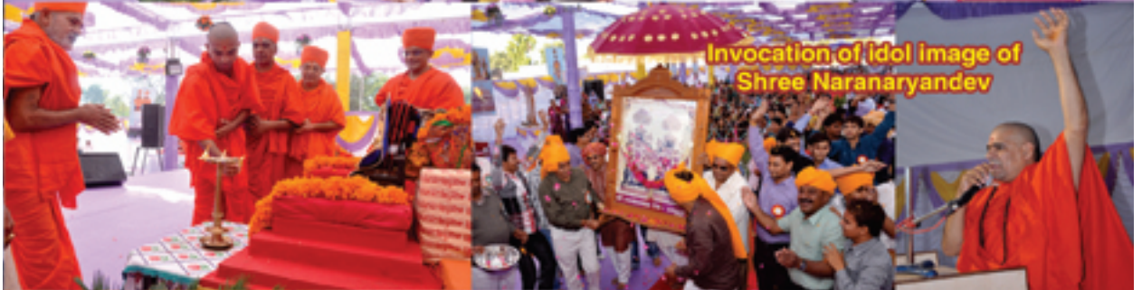
Invocation of idol image of Shree Naranaryandev