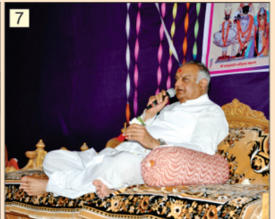
(1) Kesar Snan Darshan of Shree Narnarayandev by H.H. Shri Acharya Maharaj in Shree Swaminarayan temple, Kalupur. (2) H.H. Shri Mota Mahaaj performing Poojan of Nutan Kalash of Rangmahol Ghanshyam Maharaj, Ahmedabad. (3) H.H. Shri Acharya Maharaj and H.H. Shri Laji Maharaj performing ritual of invocation of idol iages in new temple of ladies devotees in Jetalpur. (4) Satsang Sabha in the pious company of H.H. Shri Acharya Maharaj in New Chapter Richmond of ISSO. (5) Saints and Haribhaktas performing aarti of Yagna in our Detroit temple (America). (6) Shri P.P. Swami and saints Mandal performing Satsang in the pious company of H.H. Shri Acharya Maharaj in new Chapter Jackson Ville of ISSO. (7) H.H. Shri Mota Maharaj blessing the Sabha after Khat-vidhi ritual of new Yatrik Bhuvan in Muli temple.